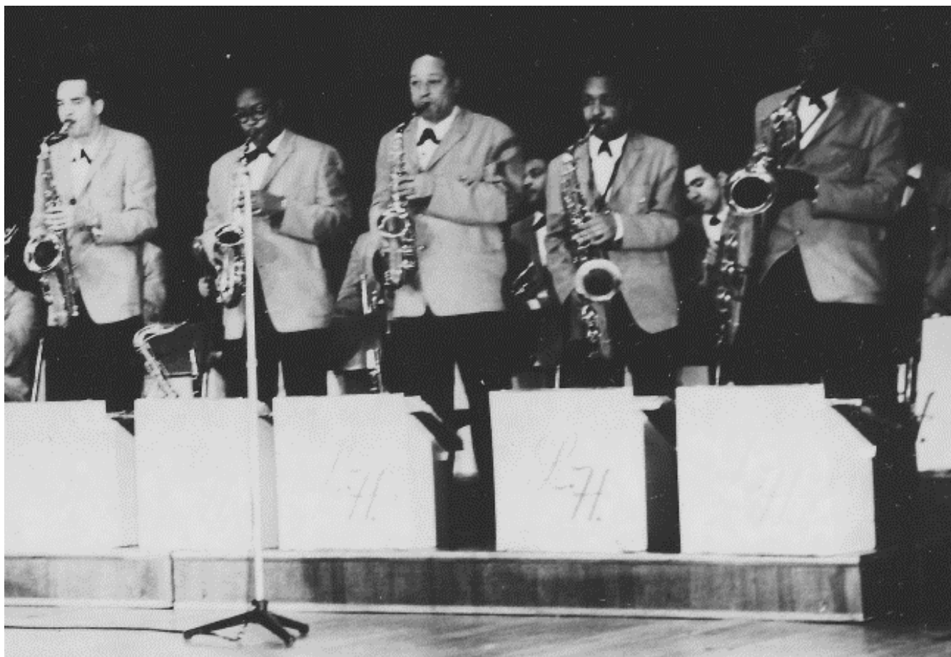
Lionel Hampton's reed section, 1961/03/01 in Lucerne, Switzerland From left to right: John Neely(ts), Ed Pazant(as), Bobby Plater(as), Andy McGhee(ts), Lonnie Shaw(bs)